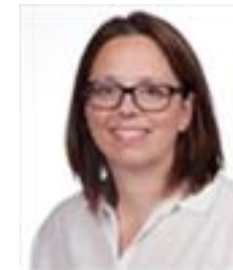
MS Address BHS Vice Principal DSL